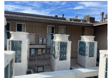
Mitsubishi Citi-Multi Smart HVAC Outdoor System Installation