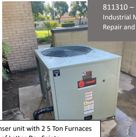
Installation of new Trane 10 Ton Condenser unit with 2.5 Ton Furnaces for the Church of Jesus Christ of Latter-Day Saints.

We are small enough to Listen and big enough to Deliver.