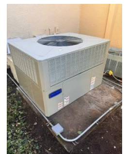
American Standard 5 Ton Package Unit Replacement

We have developed long-term relationships with highly talented subcontractors, suppliers, vendors, and consultants in our area of operations to help support our projects. HHC Services LLC receives exemplary reviews where performance, cost controls, quality workmanship and timeliness are concerned.