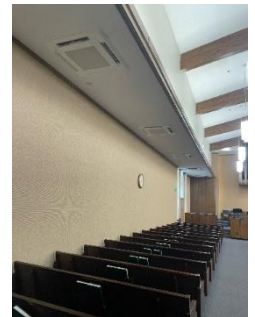
Mitsubishi Citi-Multi Smart HVAC System Indoor Installation